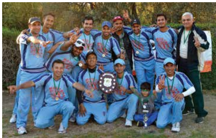
and Mustangs; the 40 Over Winners

The 30-over final was between Kazepis and PWRR, the latter being depleted by work commitments but nevertheless travelling from Dhekelia and having a go. Kazepis scored a challenging 200-9, and although PWRR briefly looked as if they might get close, once the key wickets of Blagrove and Sully were lost they subsided to 80 all out.