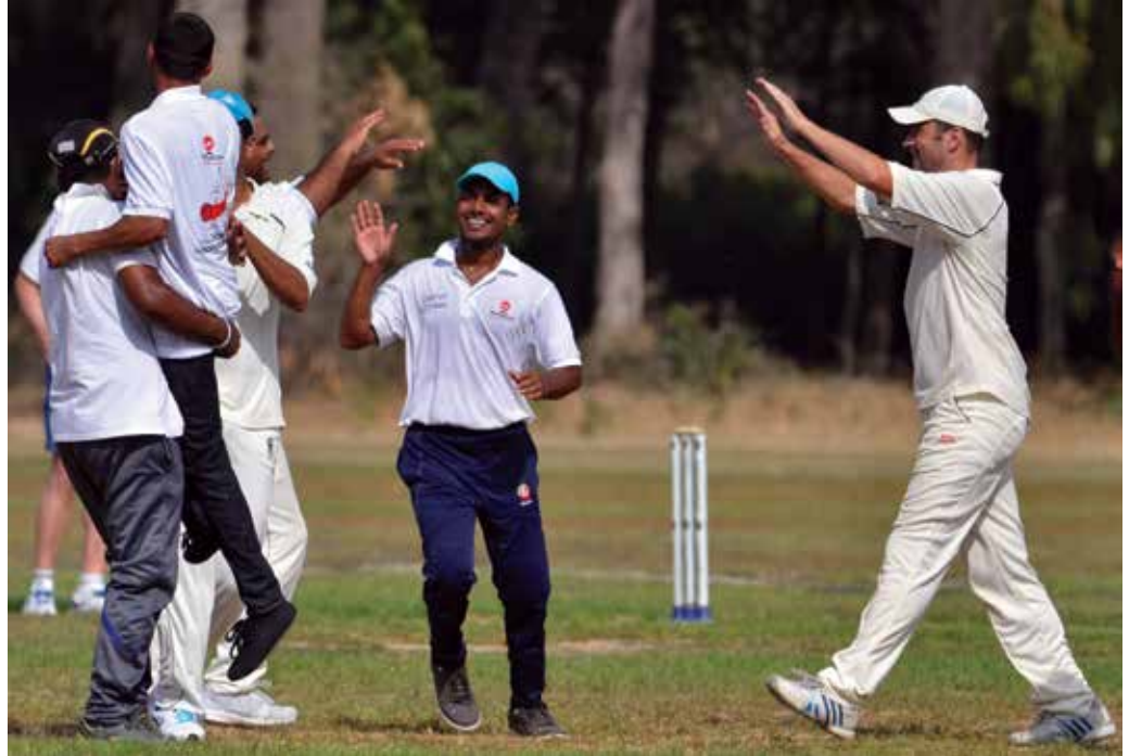
Moufflons vs Kazepis, 18 October - Moufflons celebrate a wicket

After the summer break we gained the use of the Happy Valley ground at Episkopi, but lost the UN ground at Nicosia. We were hoping for the same 8 teams to participate in the 40-over league, but one dropped out at the start and another part way through, so to provide enough cricket for teams that wanted to play we ran a 30-over league in parallel, making use also of the second pitch at Happy Valley.