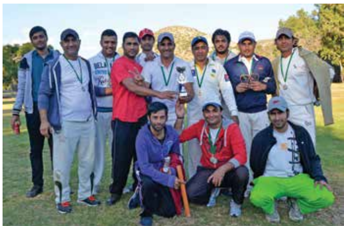
30 Over Winners Kazepis