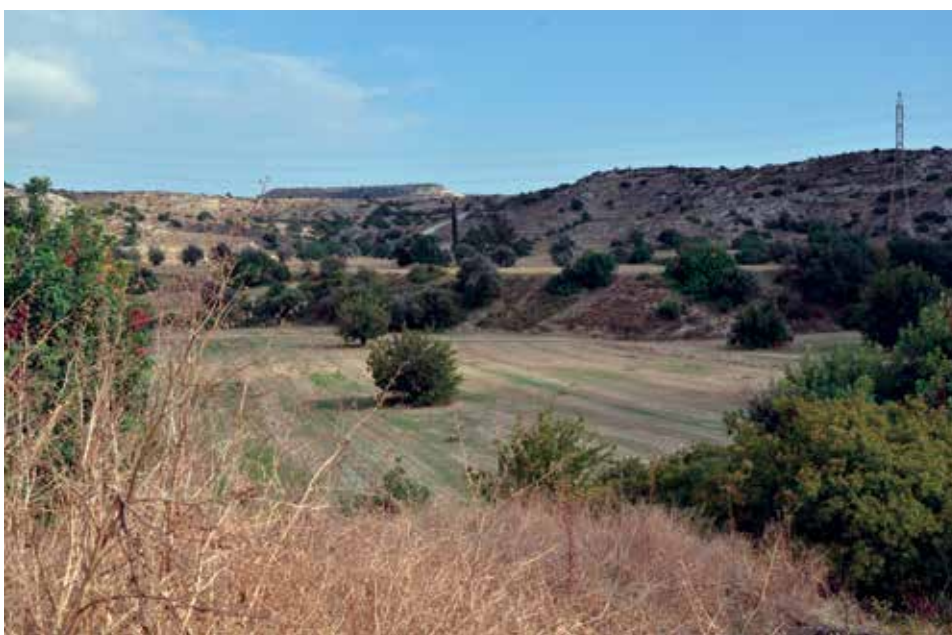
The field at Tochni before work started - as you can see, the ground is reasonably flat

The CCA has made obtaining a permanent ground a high priority in recent years and they are confident that by investing in this facility it will retain and attract new participants. As well as hosting matches, the ground will be available to schools and touring teams - opening up cricket on the island. Having the facility accessible to the youth will be key to sustaining participation in grass roots cricket over the coming years.